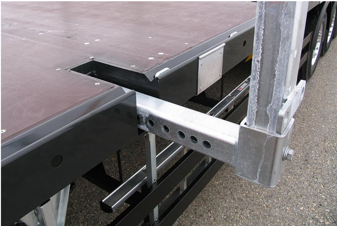
Pull-out retaining posts in lightweight tubular design, with 13 positions for load widths between 2,000 and 3,100 mm