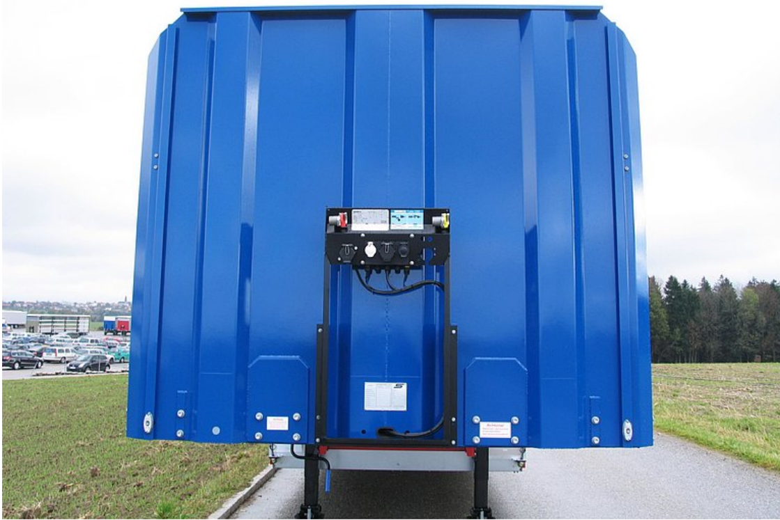
Profiled steel-sheet front wall