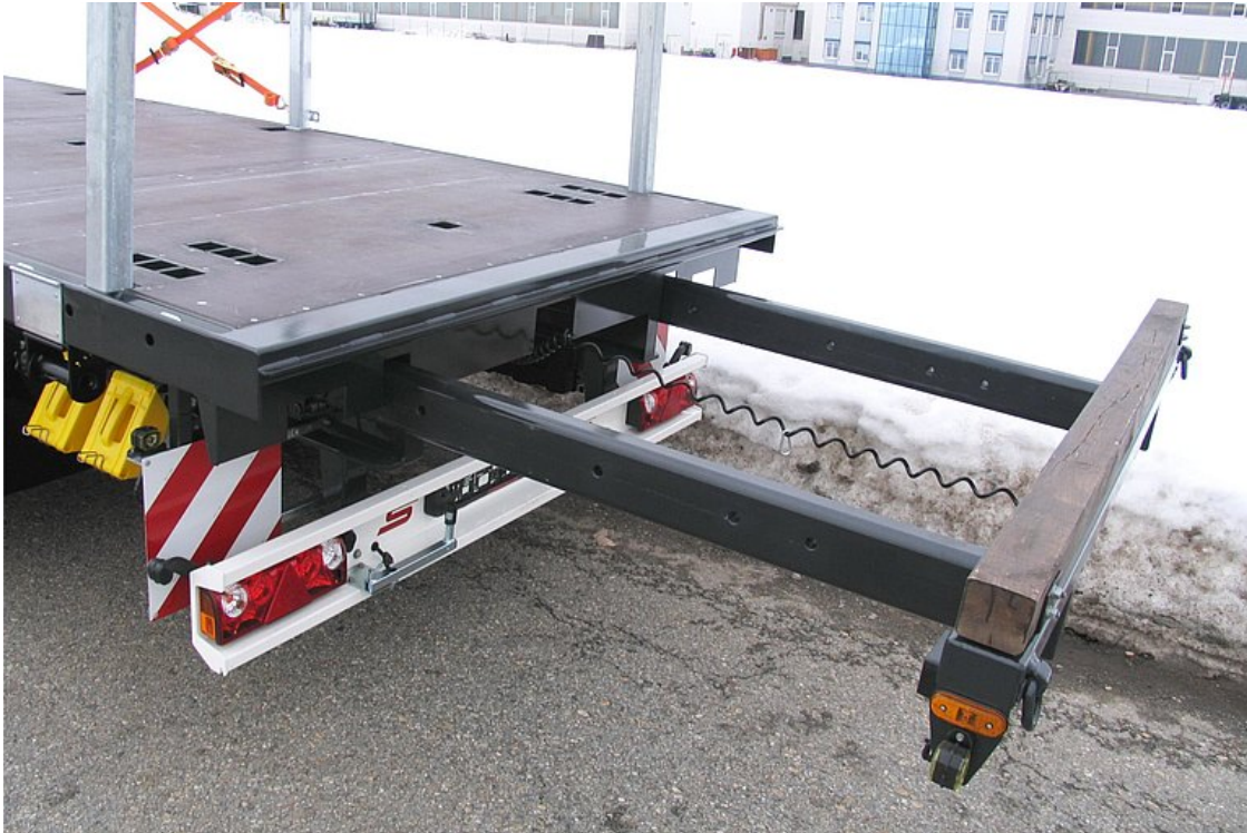
OPTIONAL: Rear pull-out frame, 1,500 mm (2 t load capacity)