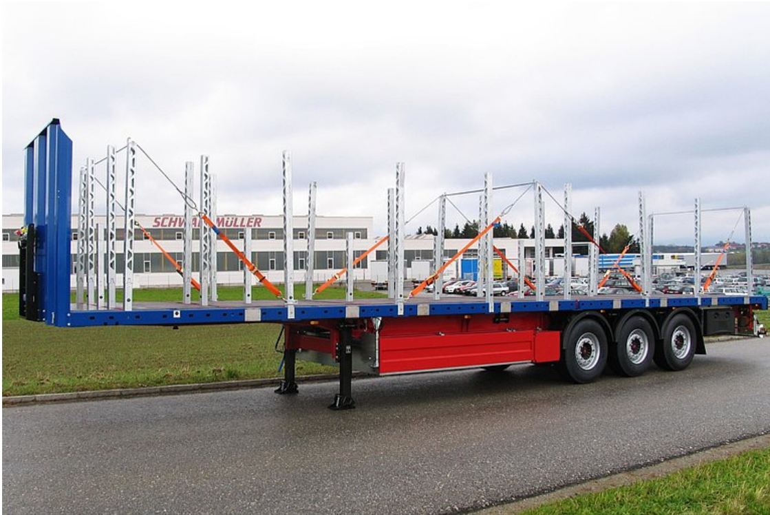
3-axle platform semitrailer for construction steel mat transport