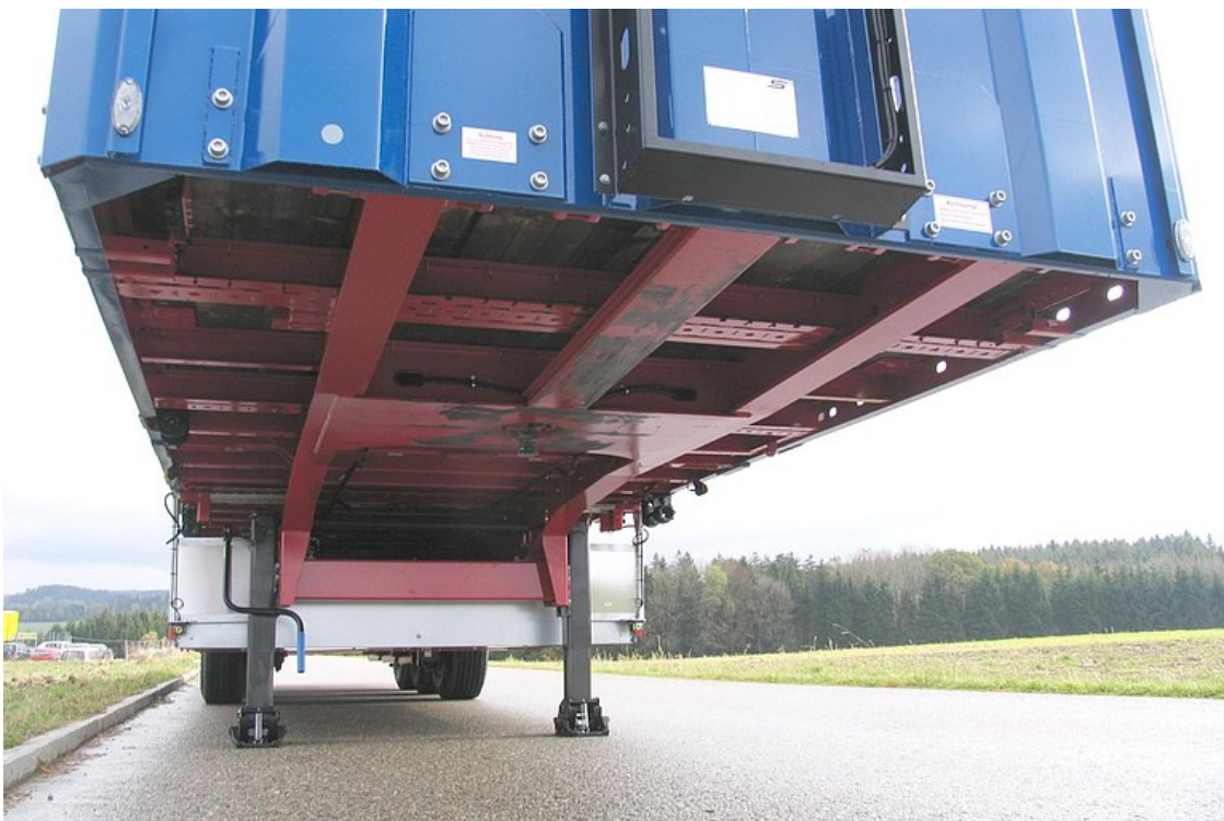
Torsionally rigid, welded ladder frame structure