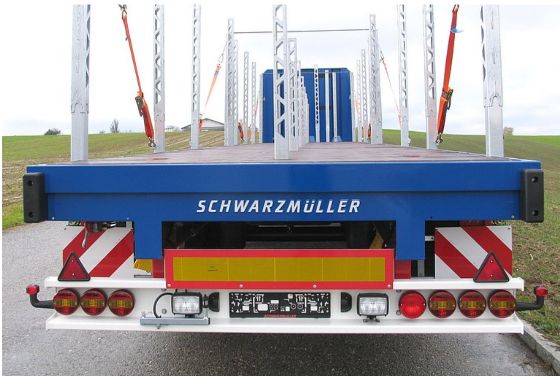
Underride protection with integrated rear light system and rubber buffers