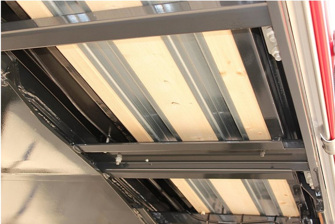
Double floor consisting of subfloor with integrated aluminium omega profiles beneath resin-coated wear floor or 27 mm resin-coated panel flooring behind