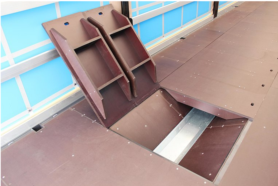
Stacker-bearing recess cover made from 27 mm resin-coated plywood with trussing