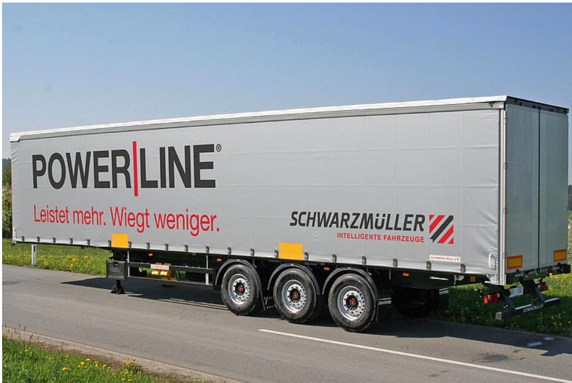
3-axle sliding tarpaulin platform semitrailer - coil - combined transport