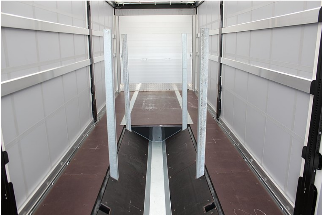
Coil recess with useful length of approx. 7,400 mm, with 5 pairs of integrated racks, for coil diameters up to 2,100 mm