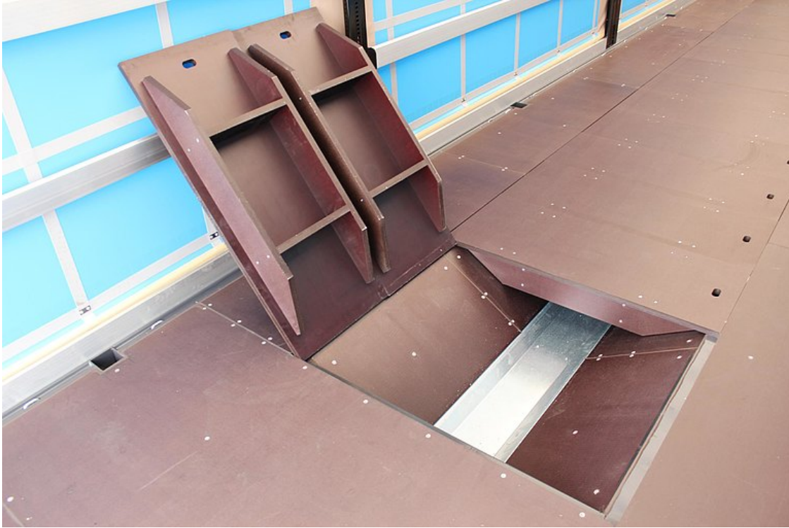
Stacker-bearing recess cover made from 27 mm resin-coated plywood with trussing