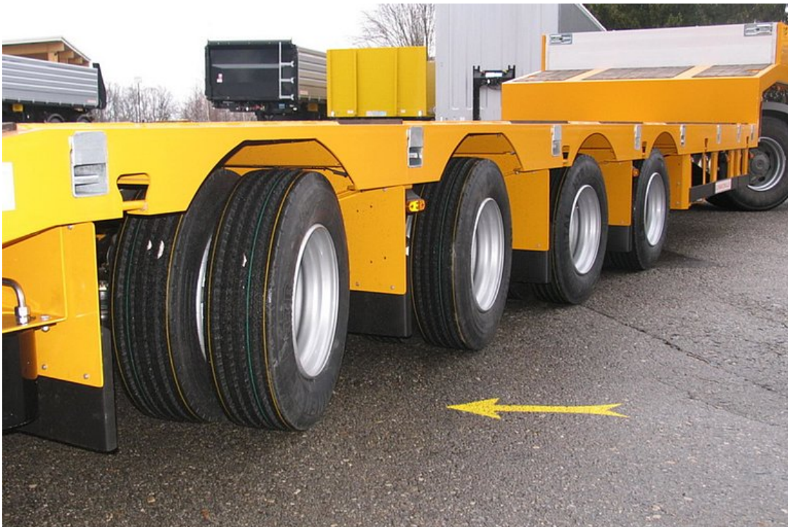
Third and fourth axles are steered trailing axles for improved cornering and lower tyre wear