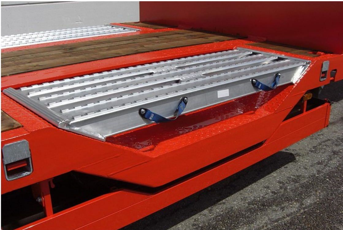
OPTIONAL: Wheel recesses for transporting special vehicles