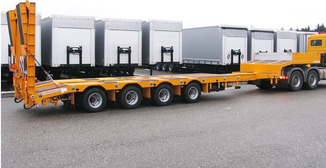
4-axle low loader semitrailer - reinforced - extendible