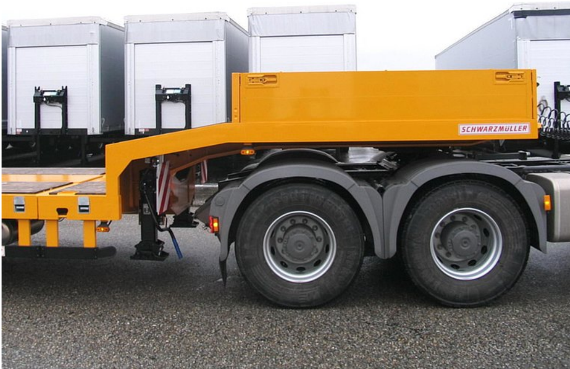
Offset platform raised at the front, incl. plug-in side walls