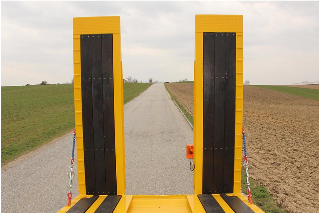
Loading ramps with hardwood flooring and welded square ribs