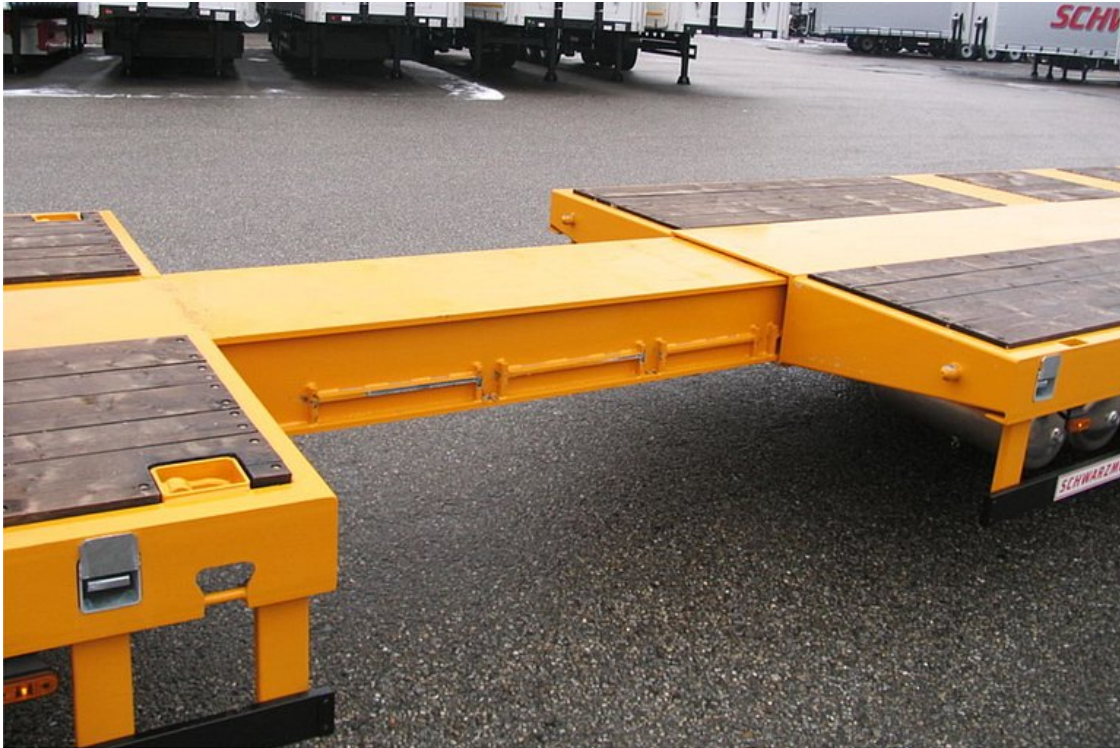
Pull-out central frame, incremental adjustment with pneumatic locking