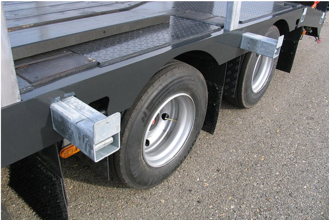
Pull-out extensions incl. extension planks for transporting wide loads